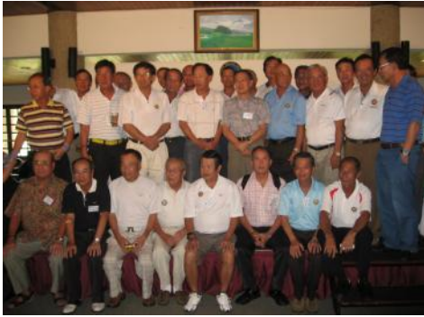
Singapore Senior Golfers Team

SSGS put up a good show but they unfortunately lost to SGSM by 12 to 8.