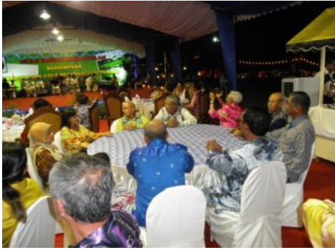
Participants enjoying the cultural show

game. Good weather prevailed on the second day.