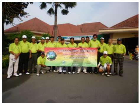
The 18 participants to Vietnam