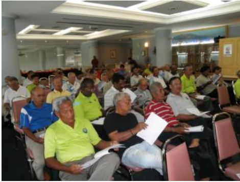
Members attending the AGM