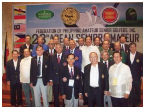
The main delegates from Asean countries

The Federation of Philippine Amateur Senior Golfers Inc. (FPASGI) was the host of the 28th Asean Senior Amateur Golf Championships 2011. The Championships were held at the Mimosa Golf and Country Club using both their courses, the Championship Course and the Acasia / Lakeview Course and the Fontana Golf and Country Club located within the Clark Special Economic Zone, from Monday, 4 July to Wednesday, 6 July. The golf clubs are about 10 kilometres from each other with Fontana Golf and Country Club a