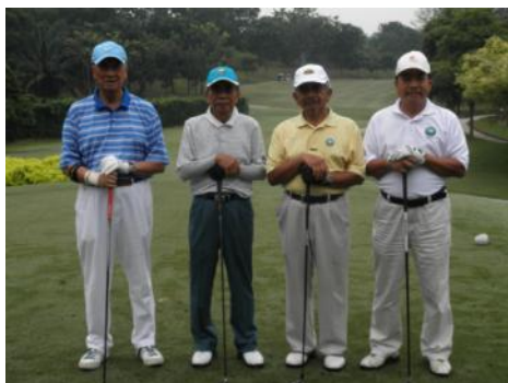
The President (second from left) participating in the Merdeka Tournament