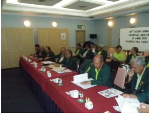
Council Members preparing for the AGM

Kajang Hill Golf Club on 15 and 16 June , 2011.