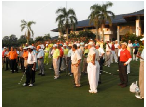
Participants before the start of the competition

Some 102 members registered to participate but only 98 participants turned up on the first day and 97 on the second day. One member was disqualified as he