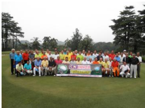
The inaugural group of the Merdeka Tournament