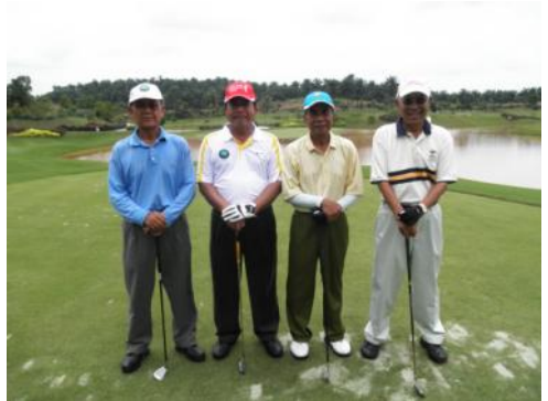
The President's flight with VIP

The championships were played on Wednesday 2 and Thursday 3 November 2011. The venue for the first round Ponderosa Golf and Country Club and for the second day it was Horizon Hills Golf and Country Club, Iskandar, Johor. There were 75 participants from SGSM who competed in the championships proper. They were joined by guests and friends of the organizers. Seven were from the Singapore Senior Golfers' Society, 38 from Johor and four from Batam.