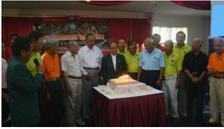
The President (centre) during the 80th Anniversary cake-cutting ceremony

a few songs to liven up the event. Perhaps the highlight of the occasion was the cutting of the 80th Anniversary cake performed by the President and the members of the Council before the prize-giving ceremony.