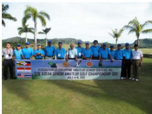
SGSM golfers during the 28th Asean Senior Amateur Golf Championship

The Federation of Philippine Amateur Senior Golfers Inc. (FPASGI) was the host of the 28th Asean Senior Amateur Golf Championships 2011. The Championships were held at the Mimosa Golf and Country Club using both their courses, the Championship Course and the Acasia / Lakeview Course and the Fontana Golf and Country Club located within the Clark Special Economic Zone, from Monday, 4 July to Wednesday, 6 July. The golf clubs are about 10 kilometres from each other with Fontana Golf and Country Club a