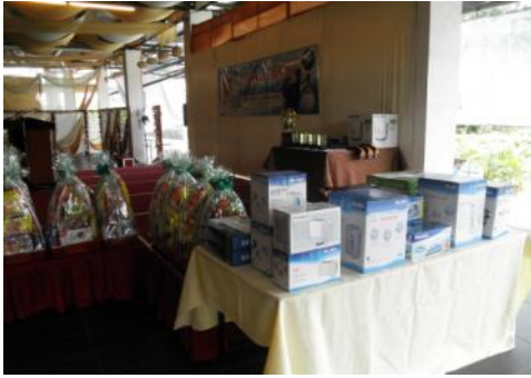
The increased number of prizes for the lucky draw