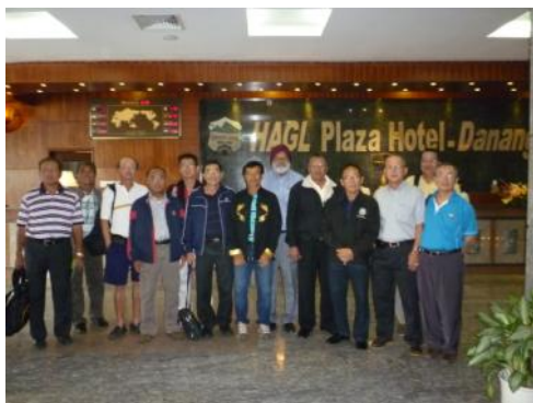
At the Hagl Plaza Hotel