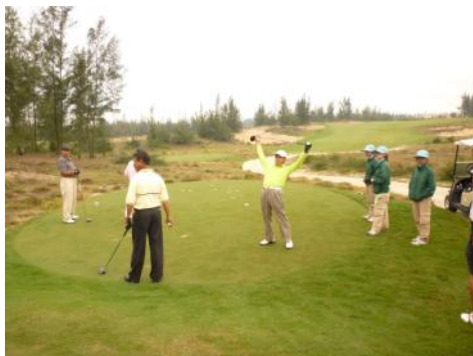
Ready to tee-off at Long Thanh GC

We had a sumptuous dinner at HALAL SAIGON Restaurant on 17 January, the day of arrival in Vietnam. After dinner, we walked back to our hotel, LE DUY , a boutique hotel located in District 1, almost in the centre of the city. Along the way we passed through the main boulevards of Saigon which were decorated with colourful lights as