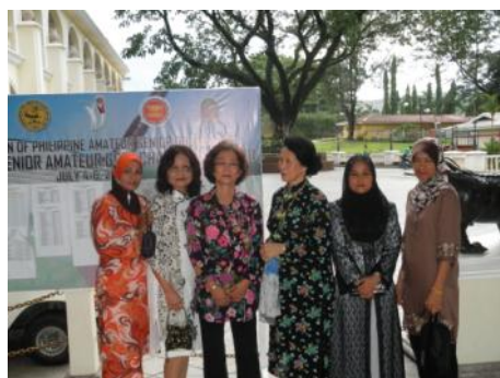
Wives accompanying SGSM golfers during the championship

The contingent was also accompanied by 11 wives, thus increasing the total number in the contingent to 62. The contingent left Malaysia on 3 July in three groups. One was by Air Asia from LCCT, the other by MAS from KLIA and the third from Kota Kinabalu. The flights from LCCT and Kota Kinabalu