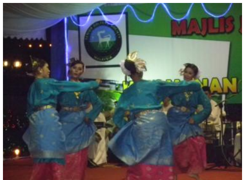
The cultural show during the dinner hosted by YAB the Menteri Besar of Johor

The championships were played on Wednesday 2 and Thursday 3 November 2011. The venue for the first round Ponderosa Golf and Country Club and for the second day it was Horizon Hills Golf and Country Club, Iskandar, Johor. There were 75 participants from SGSM who competed in the championships proper. They were joined by guests and friends of the organizers. Seven were from the Singapore Senior Golfers' Society, 38 from Johor and four from Batam.