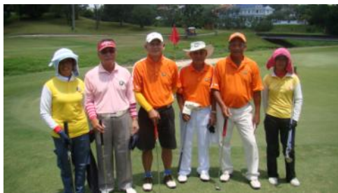
Foursome and their caddies at Seri Selangor Golf Club