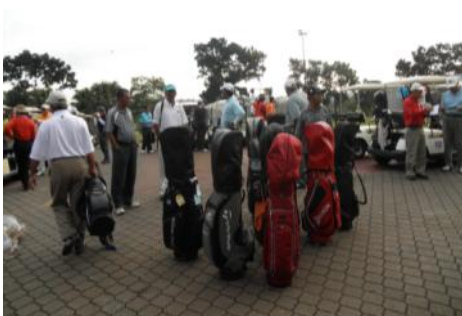
Sorting out golf bags at the Regional (South) Championship