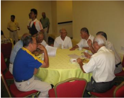
Super Seniors Golfers