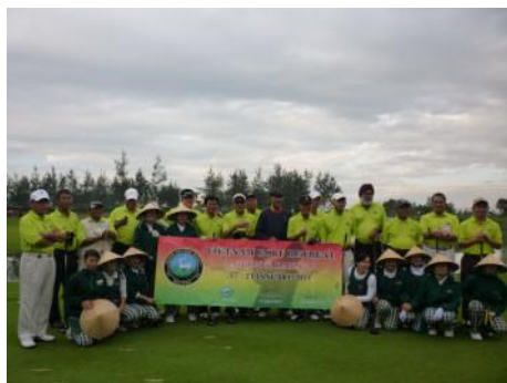
At Danang GC