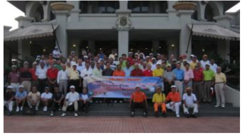
Federal Territory Senior Golfers