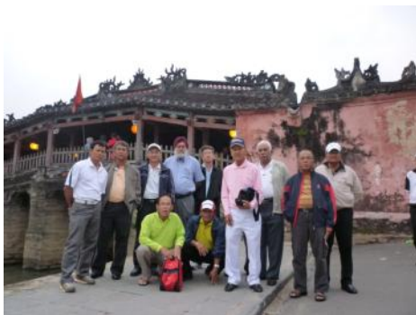
At the ancient city of Hoi An