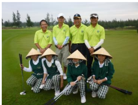
One caddy each for golf only

The next day, 19th January, we played at The Dunes Course of Danang GC designed by “ The Shark ” Greg Norman. On the way to the club, which is located to the south of the city, and only 20 minutes by coach, we passed through the marble sculpture center of Danang and saw some huge sculptures of lion, fish, eagle and many more. The Dunes is a tough course even playing from the white tees. An errant shot will end up in the wasteland which is essentially sand and there are too many bunkers guarding the greens.