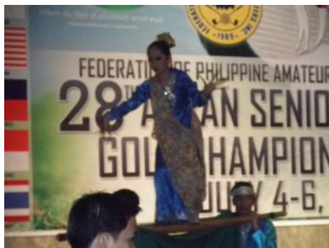
Filipino cultural show during the welcoming ceremony

flew direct to Clark while the group travelling by MAS had to travel for almost two hours by coach from Manila to Clark escorted all the way by a traffic police car.